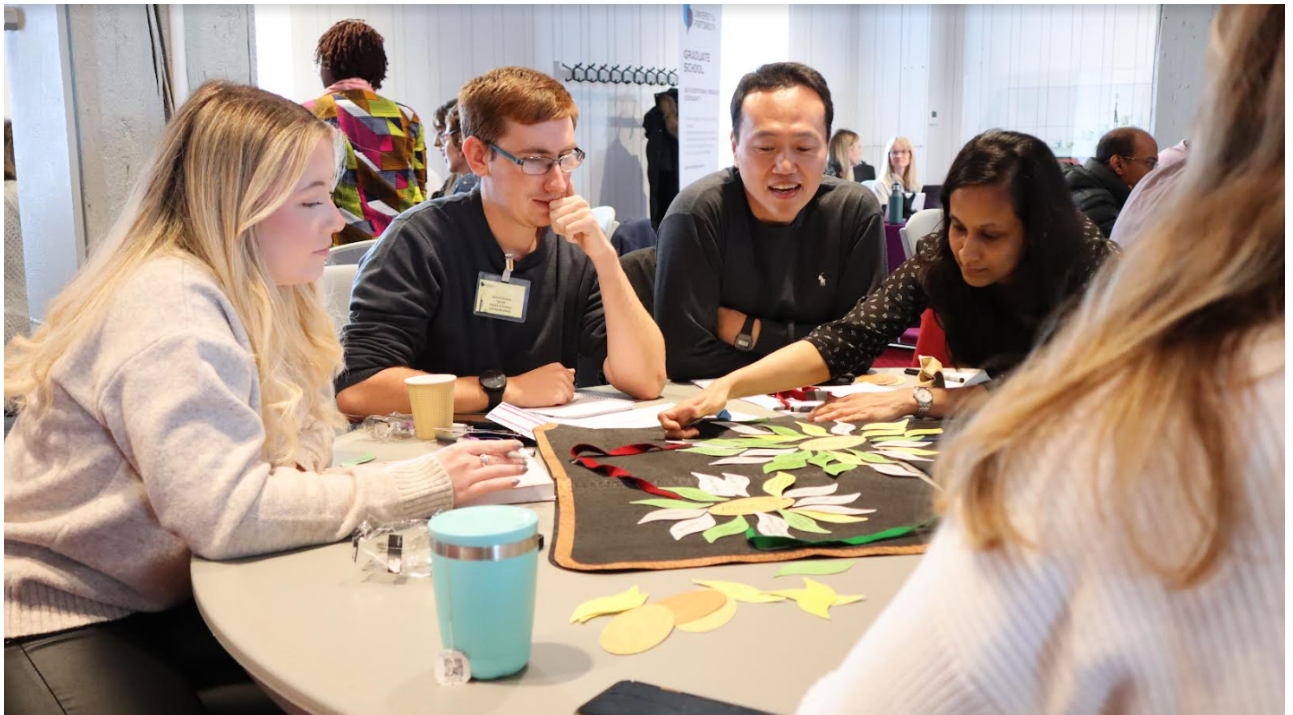
Postgraduate Research Induction

Comprehensive guidance for postgraduate research students and their supervisors